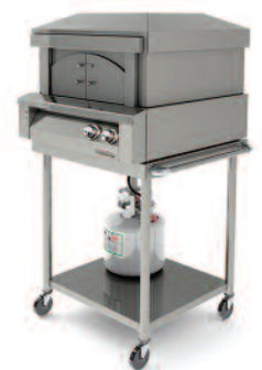
Pizza Basic Cart