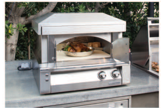
Countertop Pizza Oven Plus